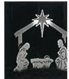
Teak Isle Holy Family Nativity Lit Star Out... Set | Weatherproof Nativity Scene f...