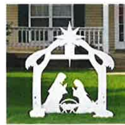
TOETOL Outdoor Nativity Set for Christmas, Large Holy Family Outdoor...