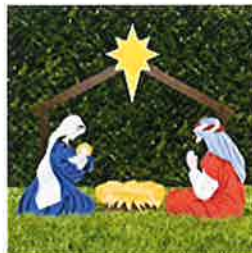
Outdoor Nativity Store Holy Family Outdoor Nativity Set (Standard, Color)