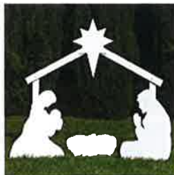
Outdoor Nativity Store Holy Family Outdoor Nativity Set (Standard, White)